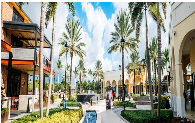
Sawgrass Mills Mall The Ultimate Shopping Destination

Home to more than 350 retail outlets, diverse dining options & entertainment venues