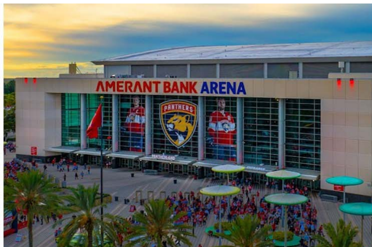
Amerant Bank Arena South Florida's Premier Entertainment Venue

Home to more than 350 retail outlets, diverse dining options & entertainment venues